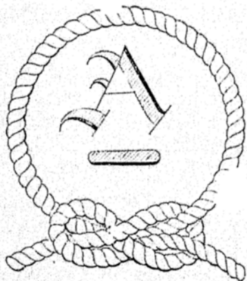
Distinguishing Mark 1 st CAPTAINS OF GUNS.