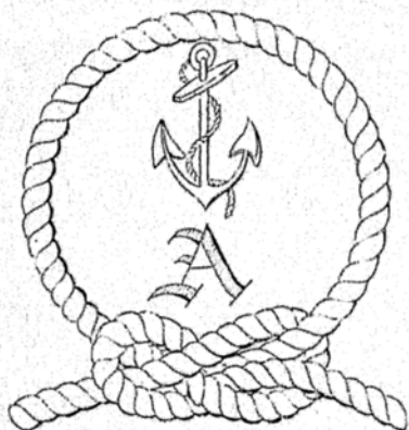
1 st BADGE OF MERIT.