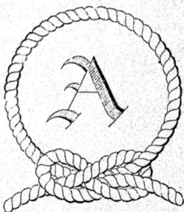
Distinguishing Mark 2 nd CAPTAINS OF GUNS.