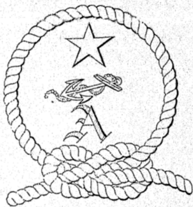
2 nd BADGE OF MERIT.