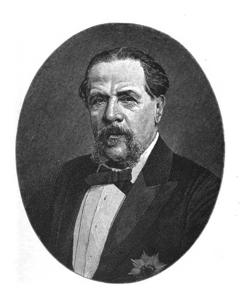
Hobart Pasha